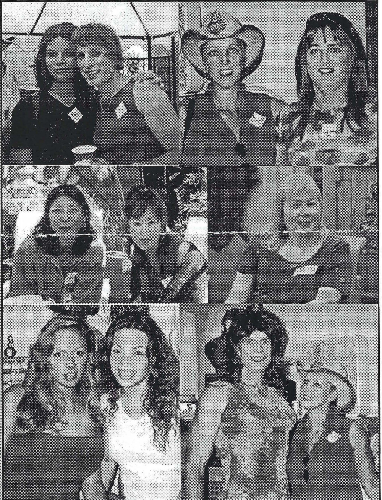
TGSF TransGender San Francisco is a group for all members of the Transgendered Community. Transgender is used as an umbrella term that includes female and male cross dressers, transvestites, drag queens or kings, female or male impersonators, intersexed individuals, pre-operative, post-operative and non-operative transsexuals, masculine females, feminine males, all persons whose perceived gender or anatomical sex may be incongruent with their gender expression, and all persons exhibiting gender characteristics and identities which are perceived to be androgynous.

The Channel TGSF TransGender San Francisco (formerly ETVC)