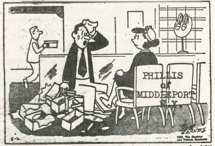
"What say we both take a coffee break and start over fresh?"