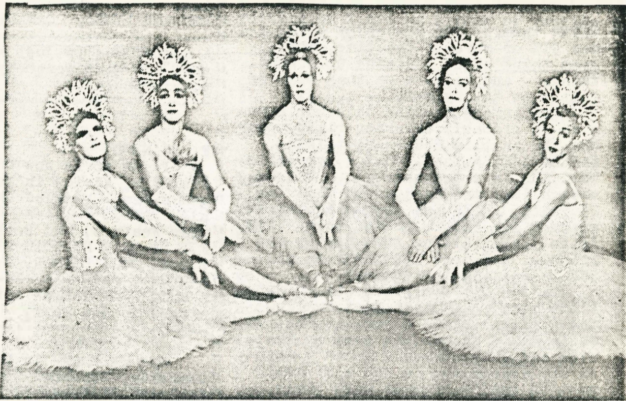
The Trockadero Gloxinia Ballet: the sweet seriousness of good clowning