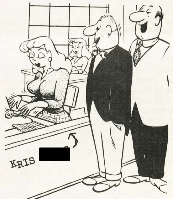
"HE'S LEAVING AT THE END OF THE MONTH TO GO TO DENMARK"

As you probably know by now, I rarely pass up an opportunity to make comments, so seeing as you asked, here goes on hormones. As far as your editorial went, I agree completely wetk what you said. They were words of wisdom for any TV thinking about ( continue on page 5)