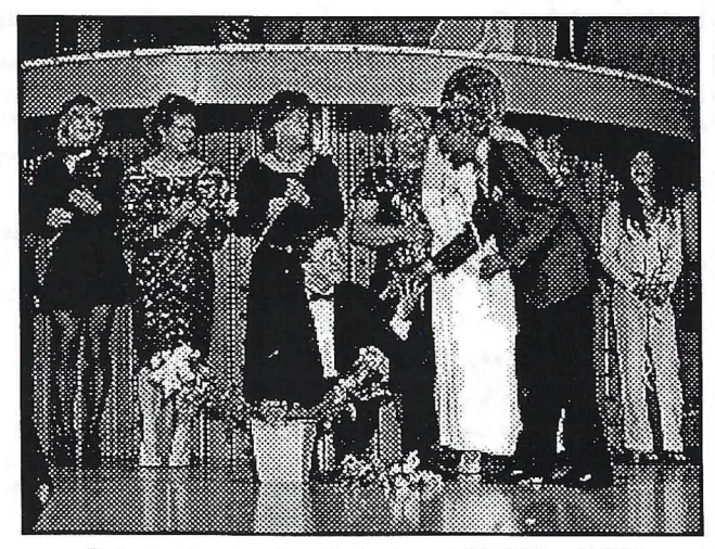
Debutantes receive their due at Cotillion 2002