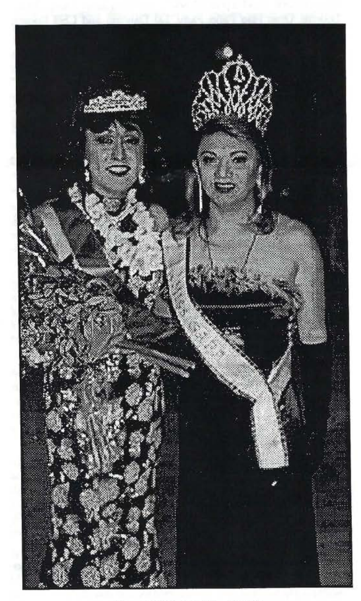
Miss TGSF with Miss GAPA