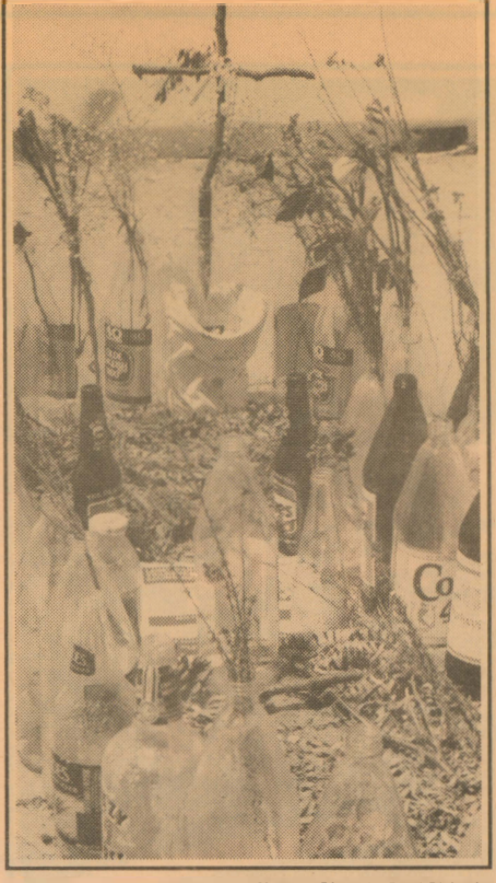
Villager

If Marsha fell from the Christopher Street Pier, questions over when he fell may be more than academic. A report from the city's medical