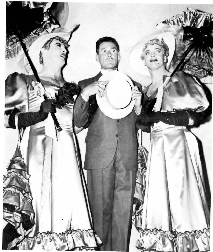
ROBERT MITCHUM AND BERT LANCASTER DOING A "SISTER" ACT FOR A HOLLYWOOD BENEFIT WITH ERROL FLYNN

Burt and Bob were assisted by the late Errol Flynn as the love-smitten swain, who could not choose between the two "sisters." Later on at this same charity costume ball, strong well-built television and screen star Broderick Crawford put on a beautiful gown, borrowed Burt Lancaster's blonde female wig, put on heavy make-up to hide his beard and performed a hilarious skit. Brod Crawford was helped along in his humorous sketch by Errol Flynn and was carried on stage on Harpo Marx's back.