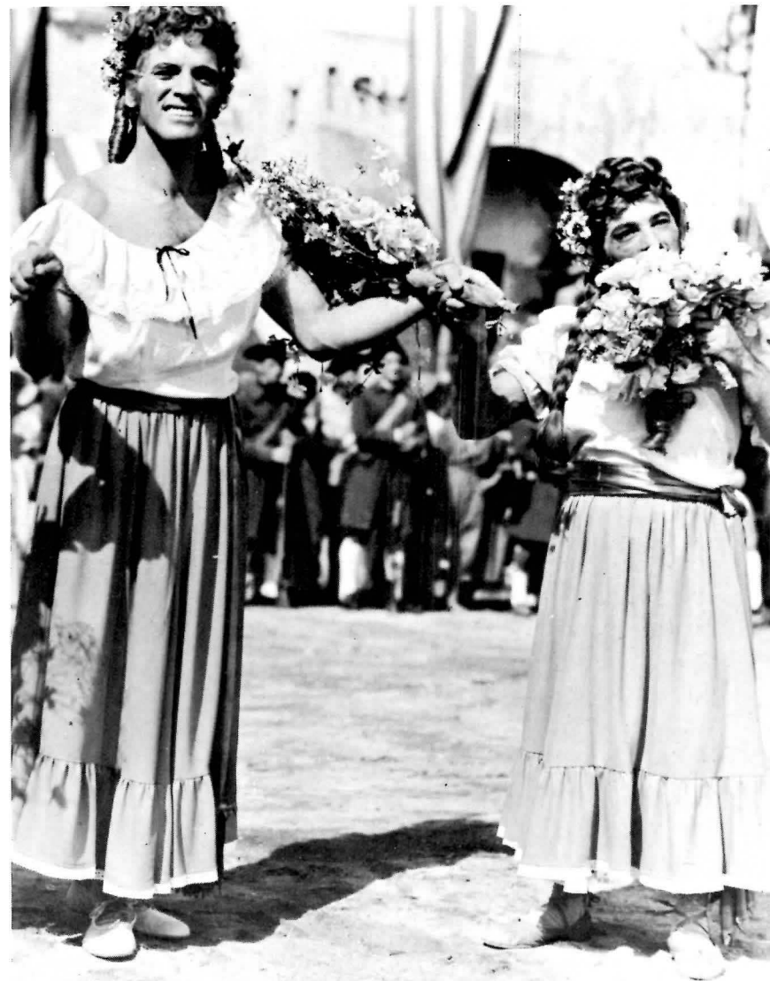
BERT LANCASTER and GEORGE E. STONE

If the wearing of female clothing for comedy effect or to serve a useful purpose to put over a dramatic scene in a movie is acceptable, then why question some transvestites? Are they to be ostracized for doing the very same thing?