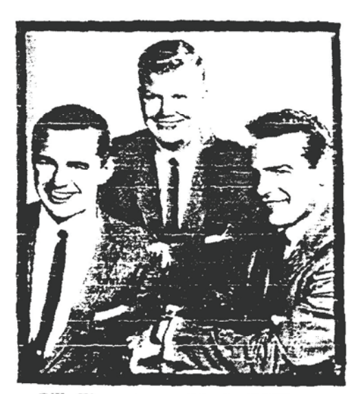
Billy Tipton (center) in the 1950's