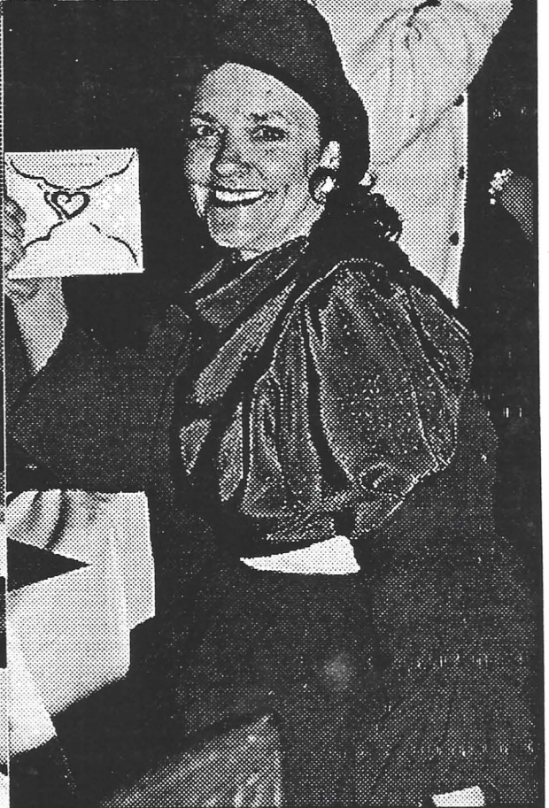
* In Black and White all over!