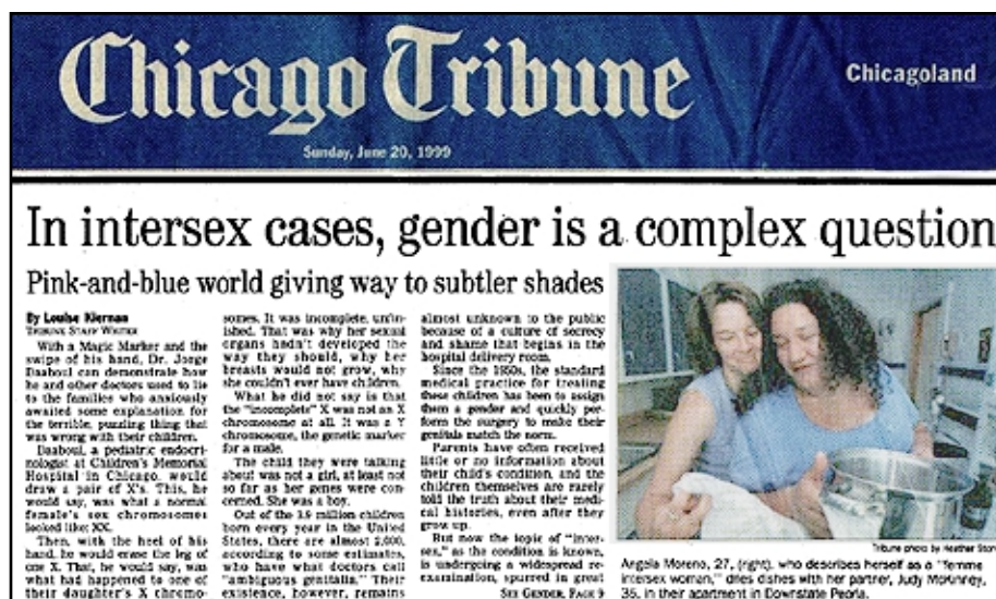
The Chicago Tribune carried a major story on the burgeoning controversy over social and medical treatment of intersexed people on its front page in June.

Even if you get no response or a negative response from your former "caregiver," remember that one drop is easy to ignore, but a flood isn't, and together we drops form a flood. ■