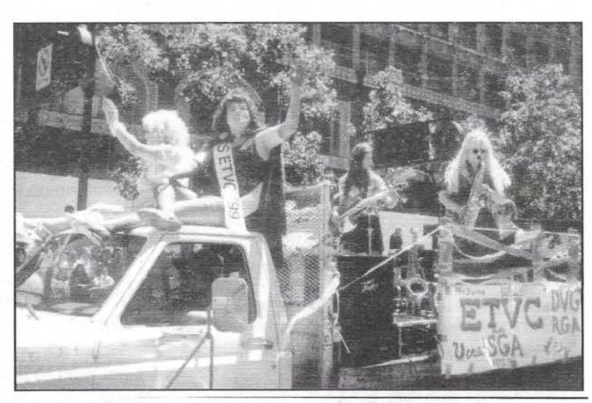
ETVC's "truck 'o' pride" at the 1997 LGBT Pride Parade

Well, guess what. A lot has changed in my life in those two years — and I'm a lot happier. I came out as a transgendered person