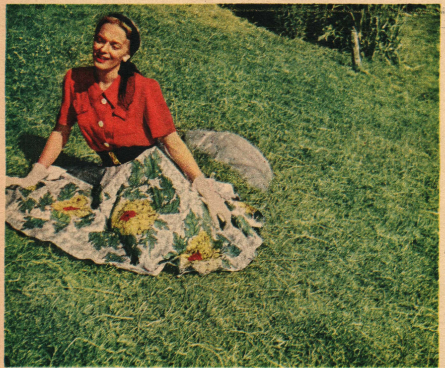
"I already had lived too many wasted years before daring to become the girl that nature intended me to be...and after the first shock I found that I felt sincerely glad that my story had come out."

so I didn't realize that my attitude toward girls was one of envy rather than admiration.