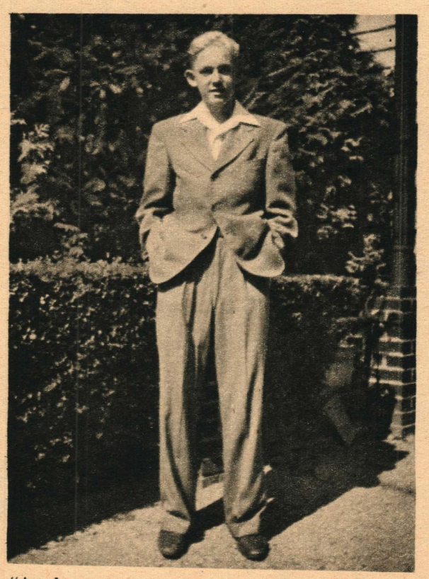
"At the teen-age stage of my life...my failure to conform to the pattern expected of a young man ... (often made me feel) lost between the sexes."

should have been a girl," that she had touched the nerve-center of my problem.