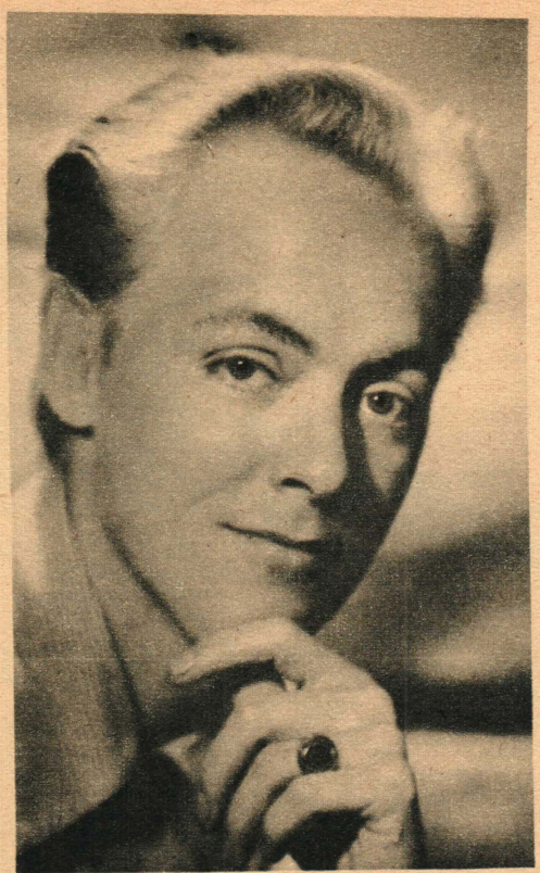
The feminizing effect of the first operation is obvious in this photograph taken in 1951.