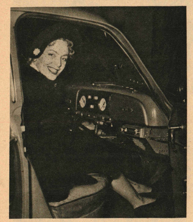
"The time came when I found it necessary to steal out of the back door of the hospital into a waiting car and seek refuge in the home of friends."