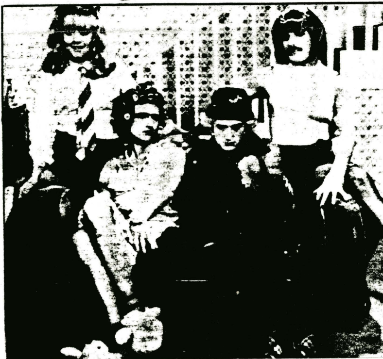
GIRLISH GA GA—Members of the Capitol group Queen slip into something more comfortable for the filming of their "I Want To Break Free" clip, the second single from the album "The Works." The Queens are, from left, Roger Taylor, Brian May, John Deacon and Freddie Mercury.

The hardest part of the weekend was late Sunday afternoon. I had to change back to my brother and this was hard to do at first. You build up within yourself such an emotional feeling that it is very hard at first to change that feeling. Plus, I had lived that whole weekend as a woman. Yet, I had to drive back to New Jersey and take care of some things. This was a weekend that I will treasure for a long time.