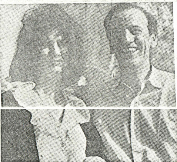
April and Mr Corbett, heir to Lord Rowallan, together at Gibraltar in 1962.

Miss Ashley was born in Liverpool, registered as George Jamieson, a boy, and brought up as a boy. She joined the Merchant Navy but took an over-