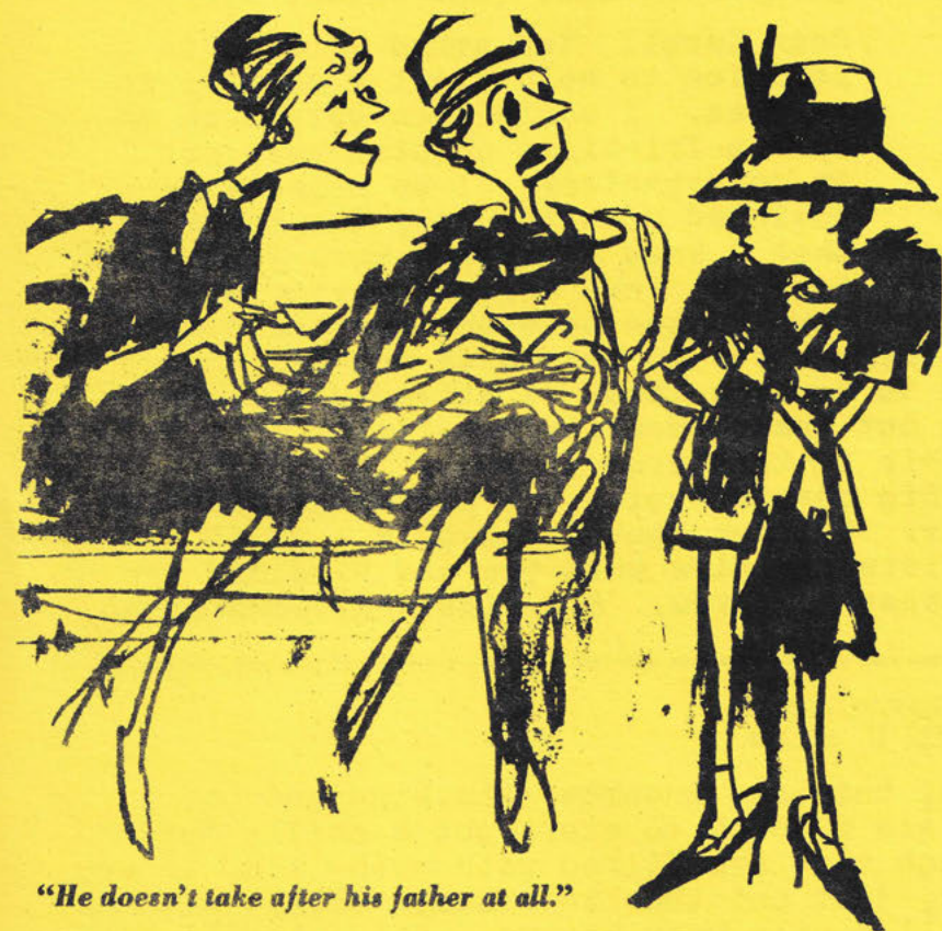
"He doesn't take after his father at all."