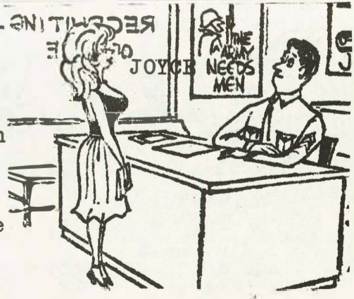
"I lost my draft card."