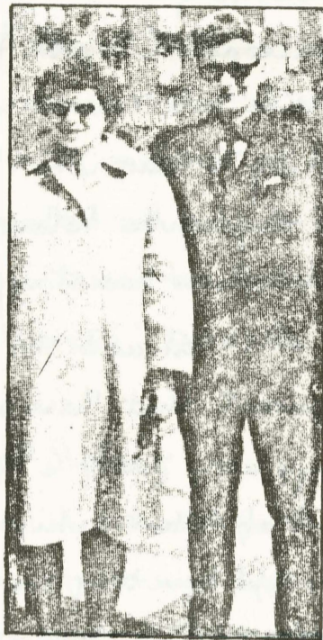
Members of the club include a number of married couples

She then recounted a story about a famous Hollywood actor who came to CHANGERS every chance he