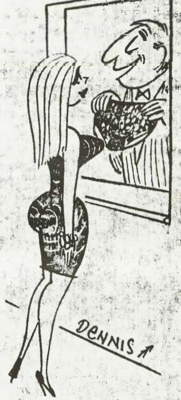
"You can reclaim these tonight at 371 Pine Street, apartment 7."