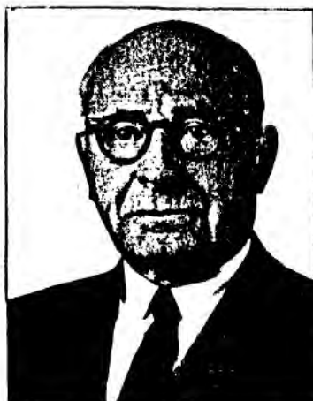
DR. HARRY BENJAMIN