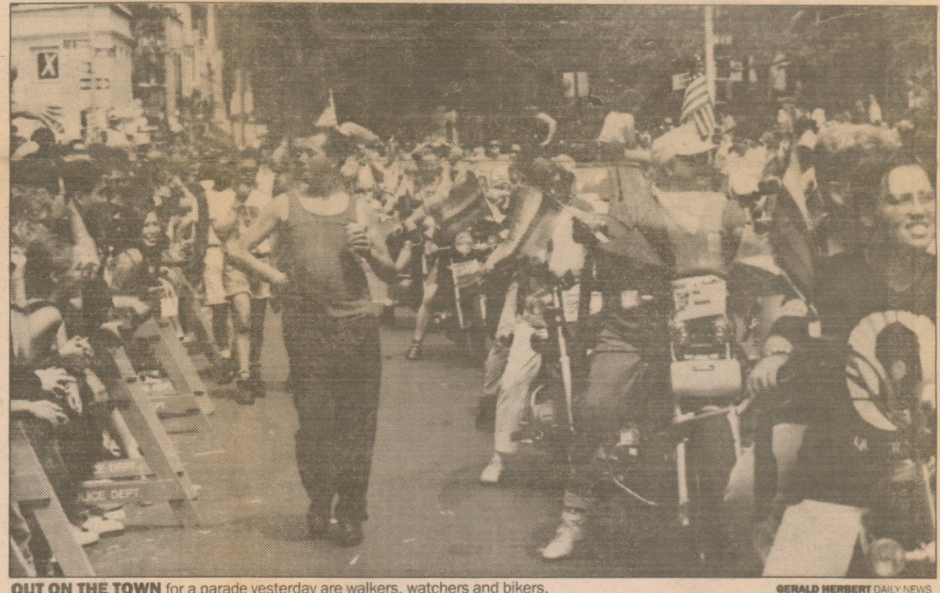
OUT ON THE TOWN for a parade yesterday are walkers, watchers and bikers.

zis used to mark homosexuals. Other signs proclaimed, "Fight Religious Arrogance" and "Crucifixion is Not for Everyone.