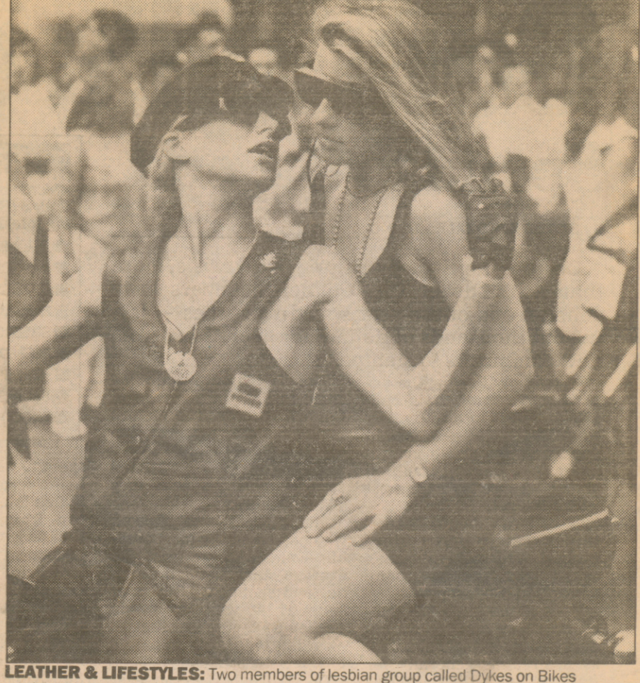
LEATHER & LIFESTYLES: Two members of lesbian group called Dykes on Bikes participate in yesterday's extravaganza. ERT DAILY NEWS