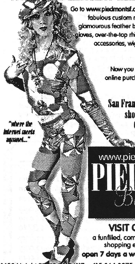
"where the internet meets aqurand..."

Go to www.piedmontsf.com and you'll find all of our fabulous custom made clothing, sexy lingerie, glamorous feather boas and hats, opera length gloves, over-the-top rhinestone jewelry, affordable accessories, wigs, makeup, hosiery, shoes, EVERYTHING... ONLINE!