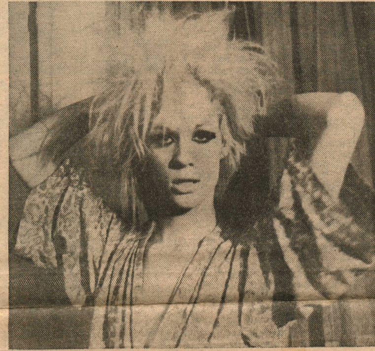
Harlow after beauty nap.