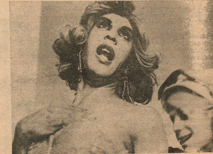
And she sings too.