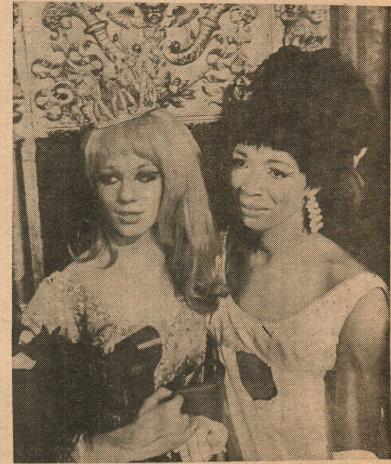
Emery and Harlow — two top TV's.