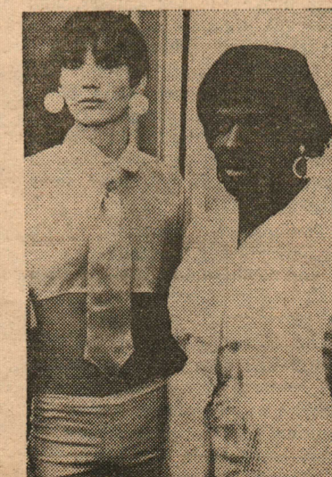
Contestant and matron.