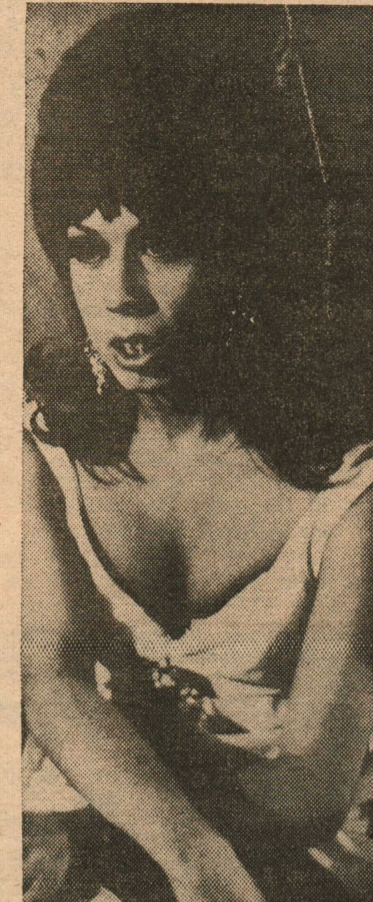
It's a fake.

"The Queen" is really a movie for queens.