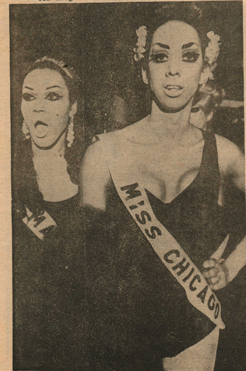
Judges' vote shocks them.