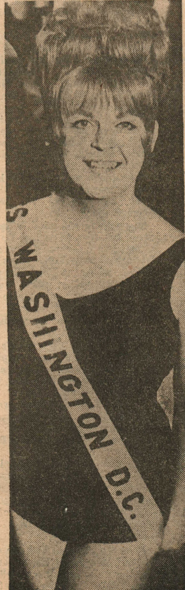
And if I win...