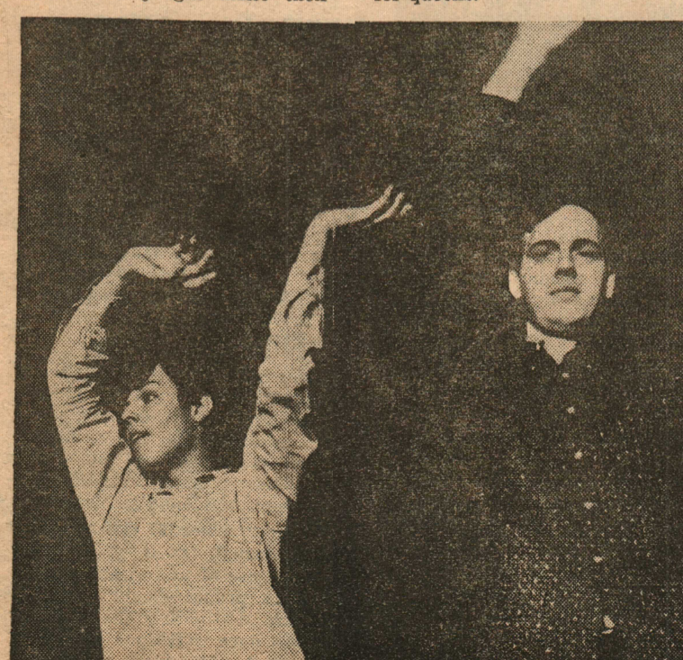
Tranvestite chorus line.